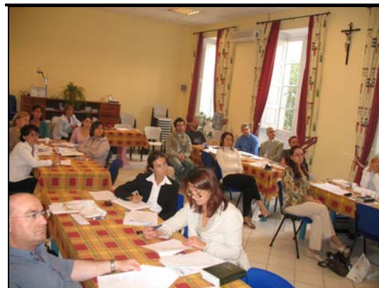
Representatives of various NGOs attending one of the training workshops on Structural Funds

The main component of the project consisted of a 50-hour training programme, for 25 representatives, of NGOs, social partners, and local councils. The aim of these workshops was to provide hands-on, practical training vis-à-vis various technical aspects concerning the application for and implementation of Structural Funds projects (in particular those under ESF).