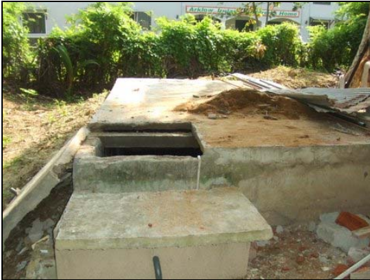
Underground water-storage for a school and orphanage in Weligama, Sri Lanka

Rain Water Harvesting is accepted as one of the most eco-friendly, sustainable solution for a community. However, its success is entrenched in the capability of the community to come together, own the project, provide labour and look after and maintain the created structures. Community mobilization and involvement are thus the key. A participatory approach of all the concerned parties – the entire village community, the Sri Lankan NGO Healing Hands Women’s Organisation, Lanka Forum as the technical support team and local authority representatives is advocated for the RWH projects which always involve a variety of skills, disciplines and competencies.