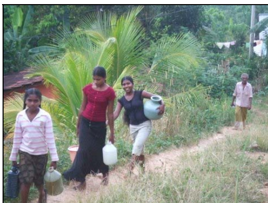
Sri Lankan women carrying water for kilometres to their village.

SOS Malta together with Healing Hands focused on designing more women targeted projects in order to improve or rebuild the lives of those vulnerable groups of women in the country. The projects operates in the Matara district over a three-year period and aim to enhance woman's sustainable participation in social and economic activities both at the domestic and community levels.