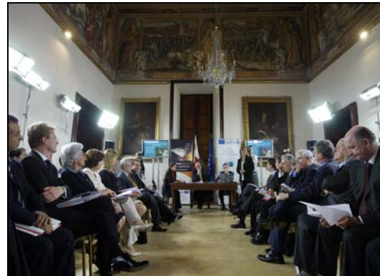
The Parliamentary Debate – held at the Palace housing the Maltese House of Representatives.

representatives, civil society representatives, journalists, and academics.