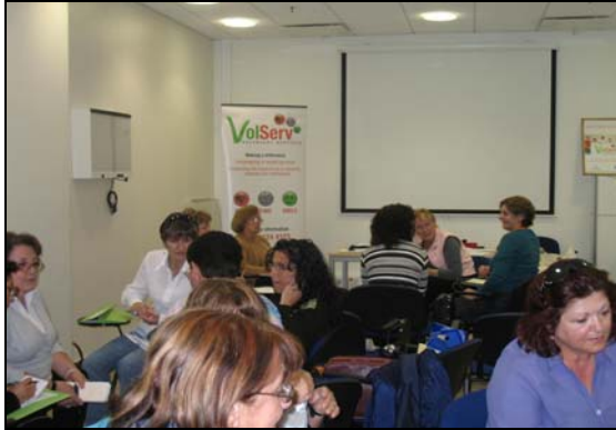
Volunteers during a training session

attended prior to commencement of their service and certificates were presented to all those who attended. In November, over 60 volunteers assisted in the migration from St. Luke's Hospital to Mater Dei Hospital.