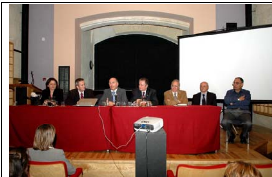
Official launch of Malta Health Network, Nov 2007.

The aim of the exercise was to set up a body that would give a voice to patients and health service users and to represent in Malta, in the EU and internationally, the interests of patients. It was also intended to develop better coordination, collaboration, and capacity building through exchange of best practice among health-related Non Governmental Organisations (NGOs), not for profit organisations (NPOs) and patient representation groups (PRGs).