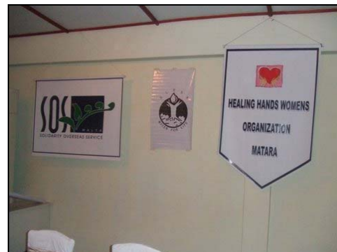
Regional seminar organized in Matara on rain-water harvesting (January 2007)

SOS Malta initiated rural development initiatives in 5 villages in the Matara district through intervention in the areas of health, nutrition, education and community organization. As an extension of its work with women, SOS Malta entered the field of supporting community based ventures for rain water harvesting a way of impacting rural lives in many ways.