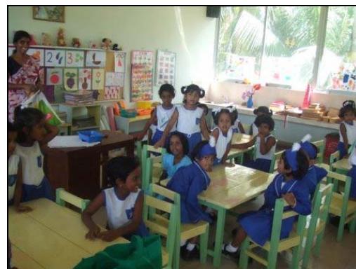
SOS Malta summer camps in Sri Lanka

SOS Malta's children's program aims to impact the lives of less privileged children, enabling them to maximise their potential and change their lives. SOS Malta works primarily in the field of education, addressing non formal education through the Resource Centre established at St Mary's Convent Matara and the partnerships created with HelpLanka and Healing Hands.