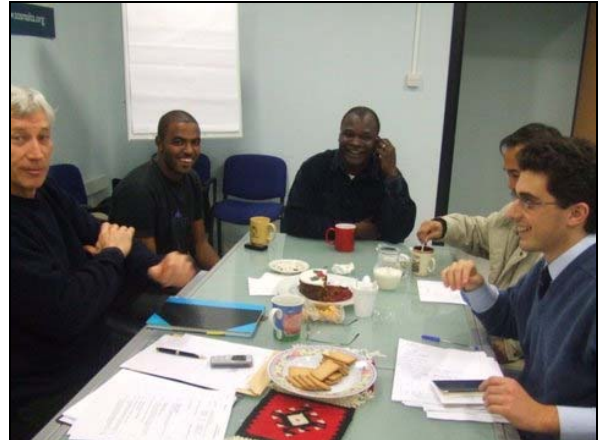
Some of the founding members of TSN Malta

is that of building bridges between third-country nationals living in Malta and Maltese and EU citizens. It aims to build these bridges by promoting intercultural dialogue and understanding as well as the integration and participation of third country nationals in Malta.