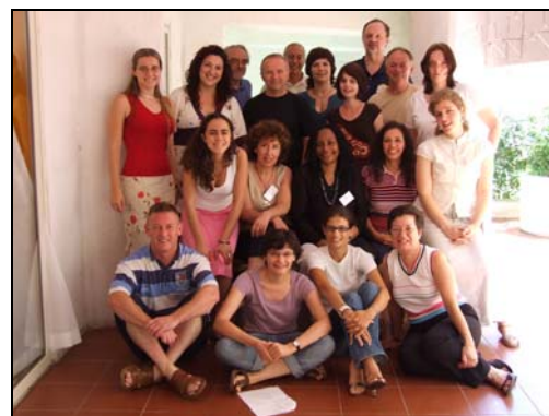
Participants of a training course for EAPN Network members (June 2007)