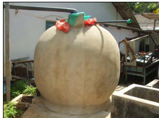
A domestic water tank produced locally for the rain-water harvesting projects implemented by SOS Malta and Healing Hands in the villages