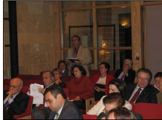
Participants during the training session for Health NGOs

A capacity building training session for health NGOs was held in November, entitled ' Understanding the development of Health Directives and National Action Plans (NAPs) '.