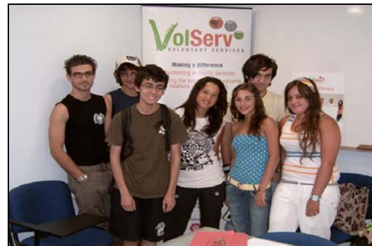
A group of volunteers who completed the VolServ training course