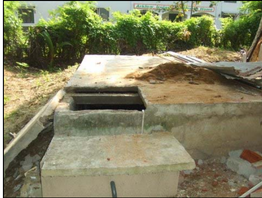
Underground water-storage for a school and orphanage in Weligama, Sri Lanka

A participatory approach of all the concerned parties – the entire village community, the Sri Lankan NGO Healing Hands Women's Organisation, Lanka Forum as the technical support team and local authority representatives is advocated for the RWH projects which always involve a variety of skills, disciplines and competencies.