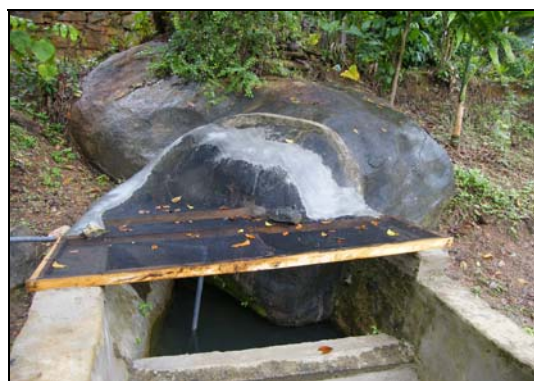
Siphoning off the natural water spring