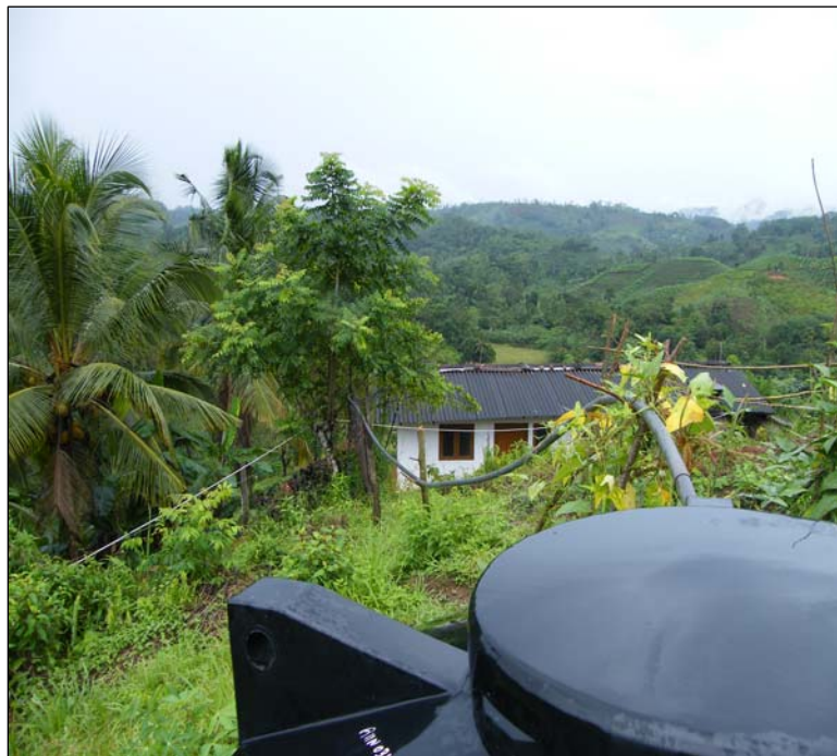
A rainwater harvesting tank providing clean water to an isolated crèche in one of the tea estates in Sri Lanka

At the end of 2008, SOS Malta identified other villages and areas in Sri Lanka where it will be assisting with the establishment of rainwater harvesting systems in upcoming months. The major part of its interventions will focus on villages within the tea estates around the South-Eastern region.