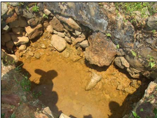
Identification of a natural spring (rain-water)

Rain Water Harvesting is accepted as one of the most eco-friendly, sustainable solution for a community. However, its success is entrenched in the capability of the community to come together, own the project, provide labour and look after and maintain the created structures. Community mobilization and involvement are thus the key.