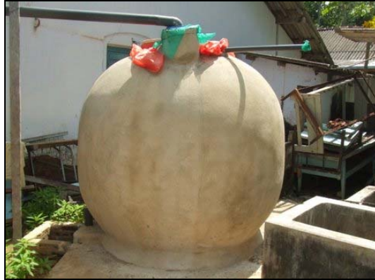
A domestic water tank produced locally for the rain-water harvesting projects implemented by SOS Malta and Healing Hands in the villages.